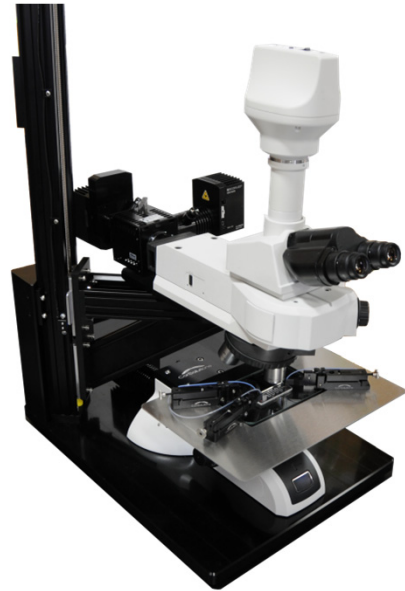
Fluorescence Microscope Workstation