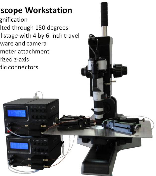
Digital Microscope Workstation shown with PeriWave pumps.