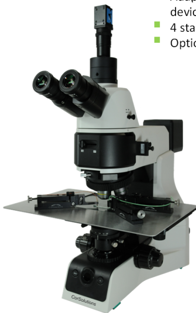
Compound Microscope Workstation

Platform Workstation can be used with a stereoscope